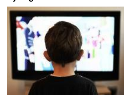
FCC Proposes Increased Audio Description Access

How are you feeling right now? Excited? Agitated? Tired? Bored? READ MORE at: WonderBaby.org