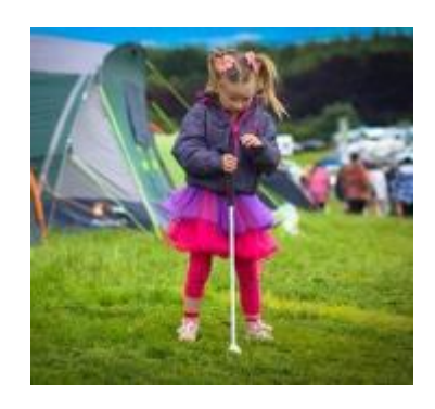
Taking a Blind Child to a Music Festival-Making it Fun and Accessible Top Tips By cmellor

The FCC proposed rules to expand video description access to blind viewers across the country. READ MORE at: WonderBaby.org